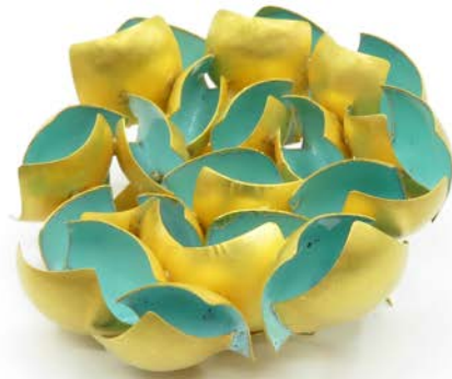
Jacqueline Ryan, Laguna, 2009 brooch, 18k gold, enamel, 2 1/4 x 2 1/4 x 7/8 in / 5.6 x 5.8 x 2.2 cm

UK born, Italian jeweler Jacqueline Ryan draws inspiration from “a profound inspiration with all things that nature gifts us”. Handmade earrings, rings and brooches of 18k gold are crafted by hand with the utmost sensitivity and immense skill. Textured or satin surfaces enhance the warmth of the material and enamels are also often employed to add color.