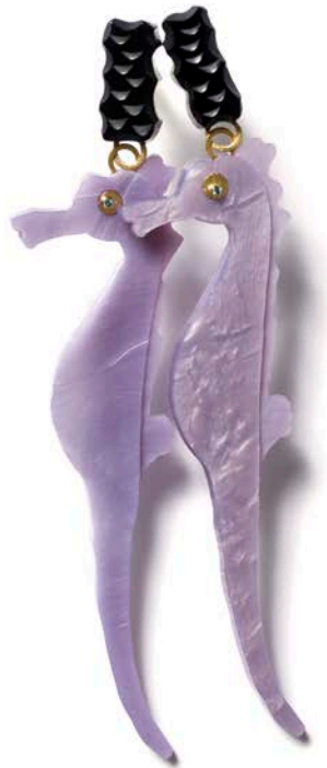
Helen Britton, Friends , 2023 earrings, galalith, treated diamonds, gold 5 1/4 x 1 1/8 x 3/8 " / 13.5 x 3 x 1 cm

A selection of works including these romantic and whimsical (long) seahorse earrings will be exhibited.