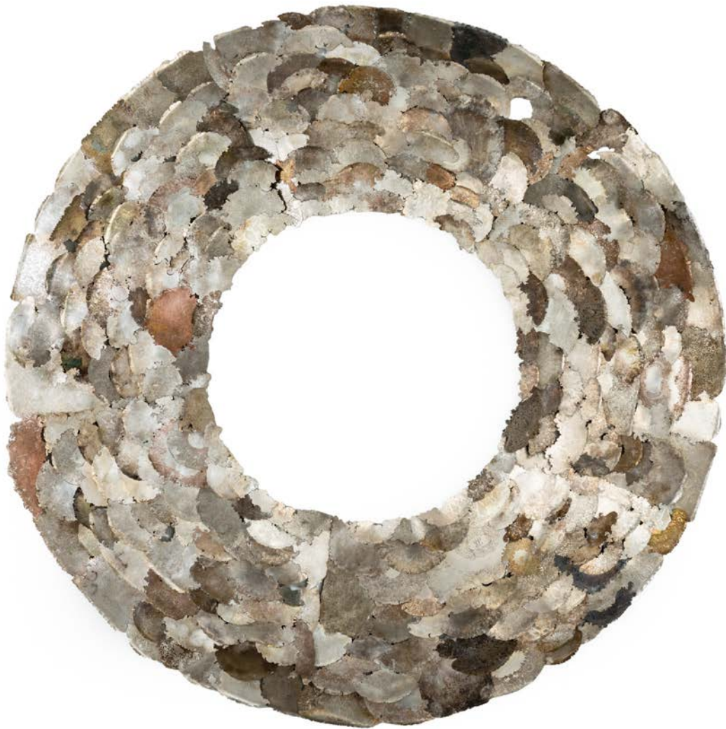
Jaydan Moore, Oculus , 2025 wall sculpture, found silver-plated platters: comprised of 5 overlapping elements 110 x 110 x 2 " / 280 x 280 x 5 cm

a breathtaking artwork exhibited in the main entrance hall outside of the DM Design Talks Theatre.