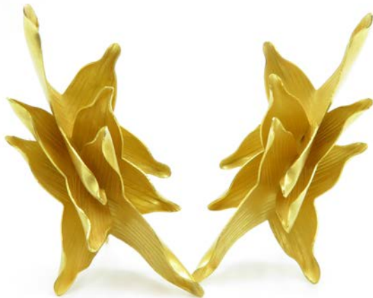
Jacqueline Ryan, Bird of Paradise, 2019 earrings, 18k gold, 7/8 x 1 5/8 x 1/2 " / 2.2 x 4.2 x 1.3 cm