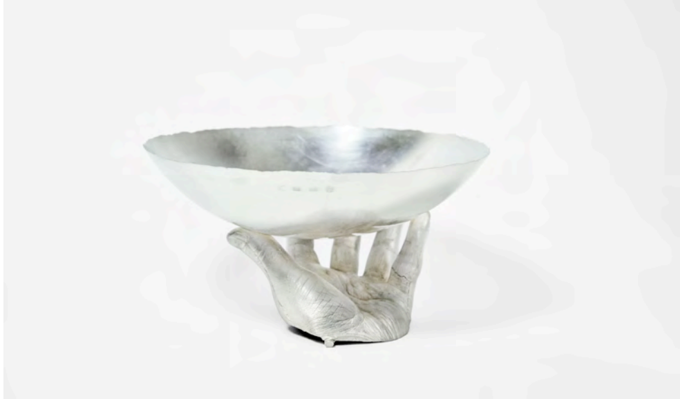
Gerd Rothmann Ein Hand voll Emotionen , 2018 vessel, 900 silver 9.75 x 9.75 x 5 inches