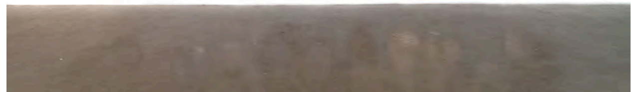
Platter / Scatter , 2019 found silver-plated platters, 255 x 102 x 2"