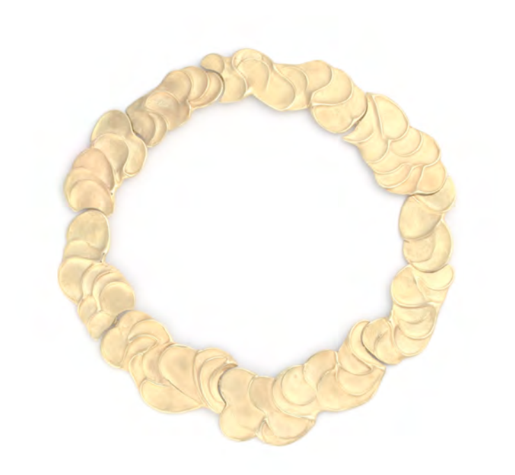
Der Vorgang des Formens in Wachs, 1988, 18k gold