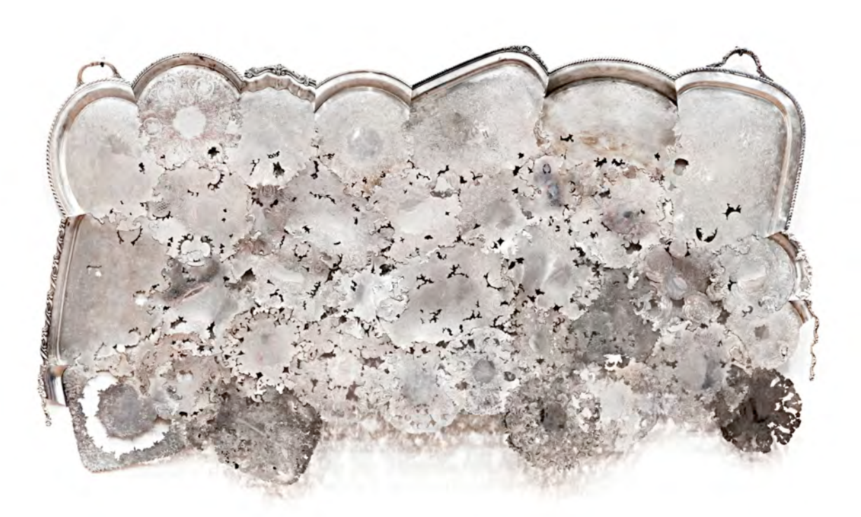
Platter / Rather , 2016 found silver-plated platters, 45 x 76 x 2"

Jaydan Moore has quickly become a crowd favorite at Design/ Miami and the wall piece that adorns the Ornamentum booth is certain to continue the momentum.