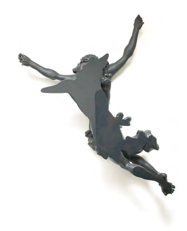
Corpus Manus, 2017 Hand-carved lime wood, auto lacquer, 44 x 31.5 x 7.9"