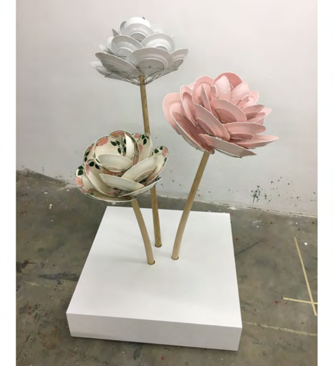
3 Roses, 2017, steel, porcelain tableware, wood, 36 x 36 x 63"

Awarded the Grand Prix Suisse Design Prize during the Basel Switzerland Design fair last June, Bielander stuns again with a new Rose sculpture, created specifically for the fair. Each flower is a hand-made rack containing a useable dinner set. The stems grow gracefully from the base as if swaying in a light summer breeze.