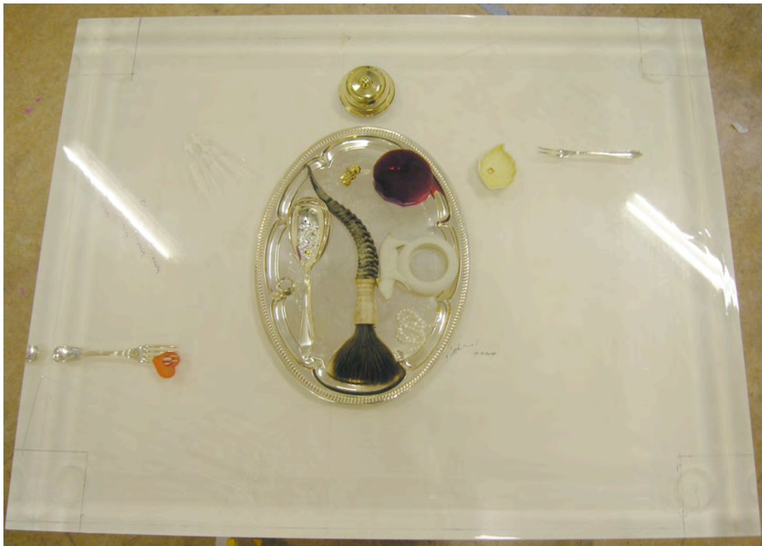
'Conversation Table' work in progress.